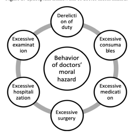
Figure 2: Conceptual framework of doctor moral hazard.

teracting with their patient interactions. Doctor behaviour has also changed from being safe and risk-free to less safe and riskier.